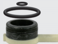
Seal kit 3 pieces